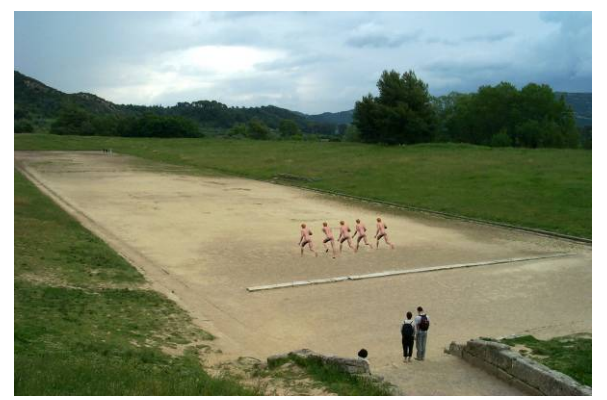
Figure 4: Visualization of virtual athletes on the stadium of Olympia

transmits a request to the SIS, which mines the corresponding audio-visual data from its database and transmits it back to the MU. The reconstruction model or animation (see figure 4) is matched to the live video stream from the web camera, transformed accordingly, and rendered.