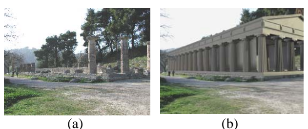
Figure 3: Real and augmented view of the Hera Temple (Olympia, Greece)

This impression is unique and one realizes only then for example how tall and colorful were the Hera, Philipeon (see figure 1(b) and 3) or Zeus temples at Olympia.