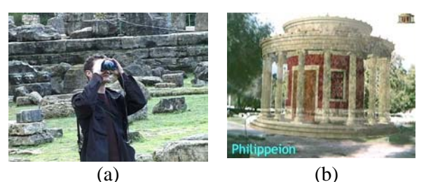
Figure 2. (a) Mobile unit (MU) with augmented reality binocular (b) Augmented reality view

the respective overlays. Additionally, an optical tracking system determines the exact position and view direction of the visitor in order to exactly place the virtual augmentations into the visitor's view (See Figure 2 (a)).