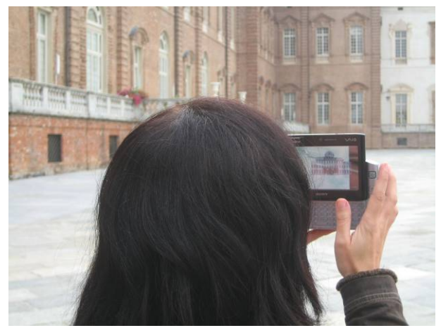
Figure 7: Historian watching Palazzo di Diana on Sony UX UMPC

UX via video see through (Figure 6). As soon as they are looking at the direction of the temple the video turns black and white and the drawing of the temple is superimposed. The Fountain d'Hercule in front of the viewing platform will be superimposed the same way.