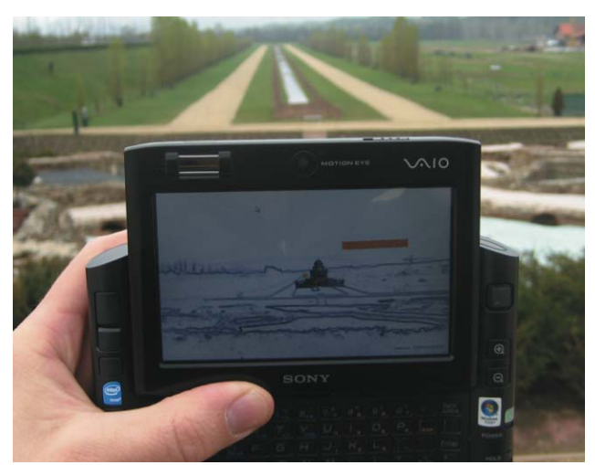
Figure 6: Tempio di Diana in a reality filtered scene of the gardens

This vast archive is the basis of our visual time machine. With the Reality Filters we are able to create this effect through the display of a Sony UX Ultra Mobile PC. In order to match the source material we are rendering the video stream like a black and white drawing. Thus overlays of frontal drawings of buildings onto the real field of vision are seamlessly integrated. The whole scene looks like a real time ancient drawing. Even visitors, guides and guards are rendered in black and white. The application consists of three spots at the site. The first Tempio di Diana (Figure 5) was located at the end of a long path along a small artificial creek. It was surrounded by water and only accessible by boat. Only ruins of the fundament are left.