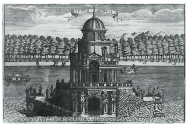
Figure 5: Drawing of Tempio di Diana at Reggia Venaria Reale

This vast archive is the basis of our visual time machine. With the Reality Filters we are able to create this effect through the display of a Sony UX Ultra Mobile PC. In order to match the source material we are rendering the video stream like a black and white drawing. Thus overlays of frontal drawings of buildings onto the real field of vision are seamlessly integrated. The whole scene looks like a real time ancient drawing. Even visitors, guides and guards are rendered in black and white. The application consists of three spots at the site. The first Tempio di Diana (Figure 5) was located at the end of a long path along a small artificial creek. It was surrounded by water and only accessible by boat. Only ruins of the fundament are left.